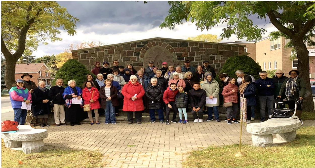
Some 54 CWL members and parishioners joined us for this very special celebration!