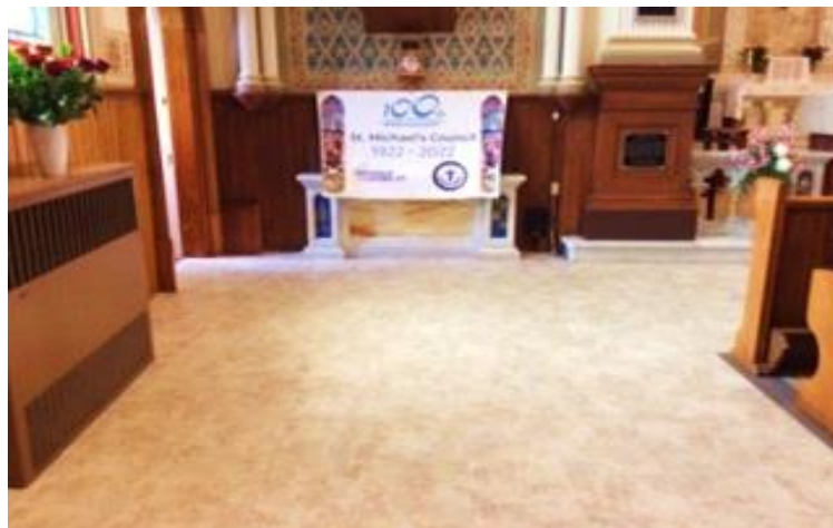
Our 100 th Anniversary Banner is proudly displayed in our church.