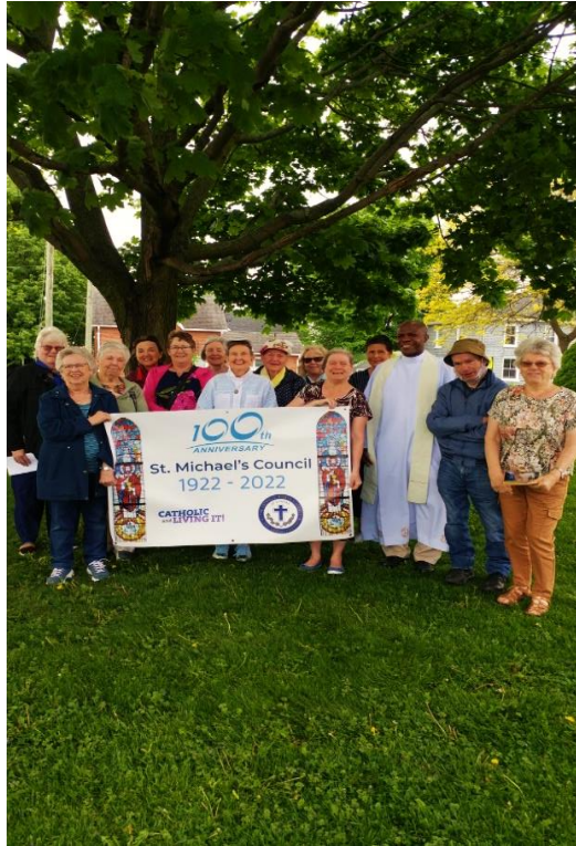
Such great support!